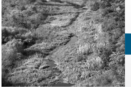
Before Kissimmee restoration began, dense mats of floating vegetation filled much of the river channel.