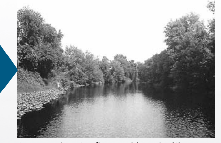
Increased water flow, achieved with various construction projects, has returned sections of the river to its historic, freeflowing state.