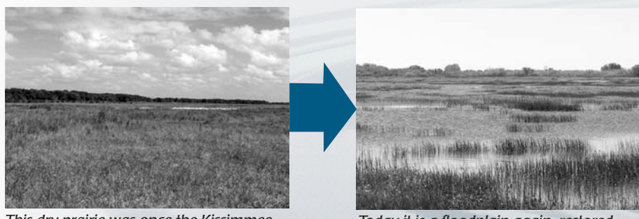
This dry prairie was once the Kissimmee River's floodplain, home to countless species of wading birds, fish, invertebrates and aquatic plants.

Today it is a floodplain again, restored with water and filled with abundant wetland life.