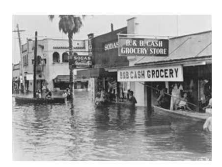
In the 1940s, a series of devastating floods inundated towns and farms in the Kissimmee Valley. This prompted federal action, and the Kissimmee Flood Control Project was born.

Initial results of Phase I restoration are extremely encouraging. Highlights are covered here and at www.sfwmd.gov